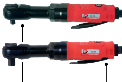
3/8" ratchet EG700