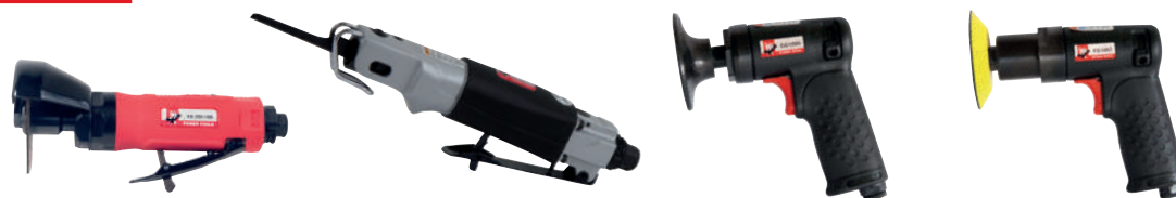
75 mm Cut-off tool EG250-19R