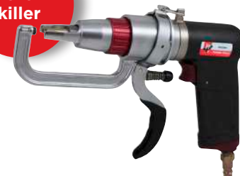
Spot weld drill, Boron killer, uses tungsten carbide drills EG327HN