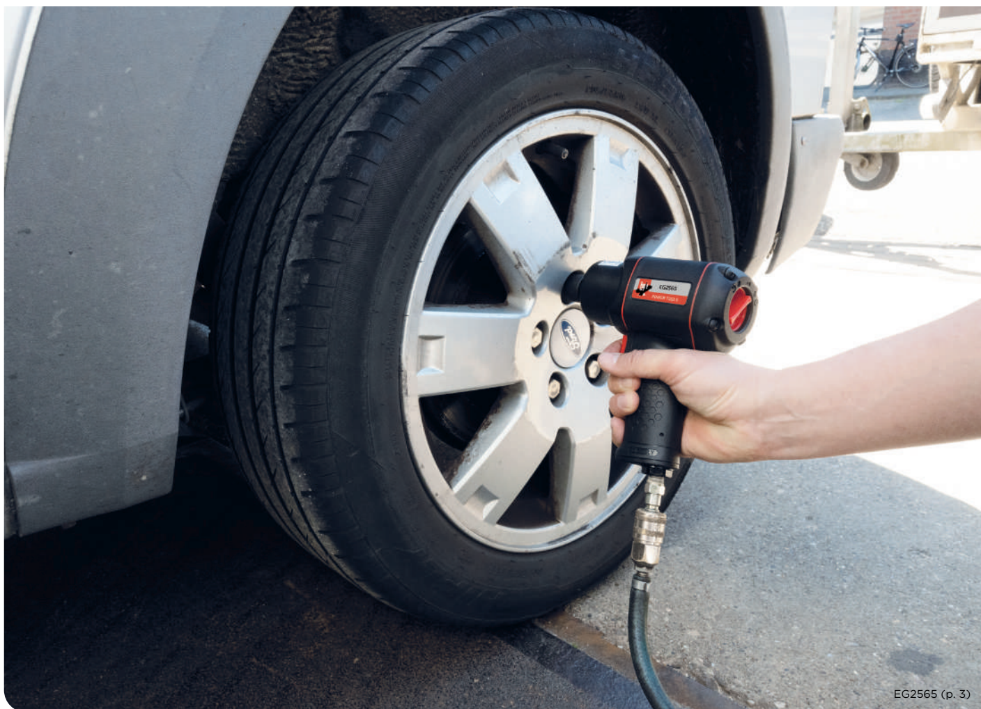
EG2565 (p. 3)