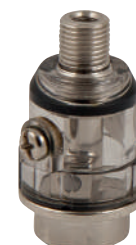
Mini oiler /Lubricator