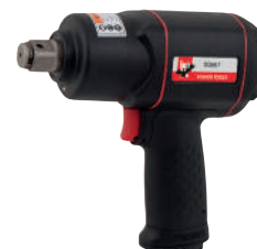
1/2" Impact wrench EG1460A