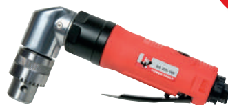
90° Angle drill 10 mm EG225-19R