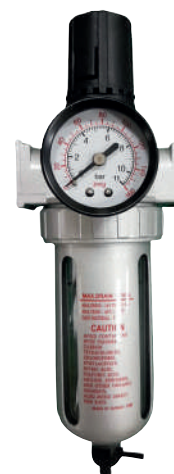
Air pressure filter-reducer with manometer, Oil lubricator EG001894