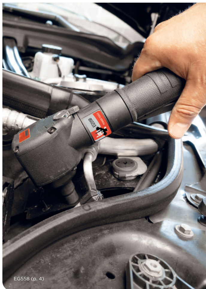
EG558 (p. 4)