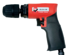
Reversible drill 10 mm EG213-19R