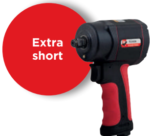
1/2" Angle impact wrench EG558