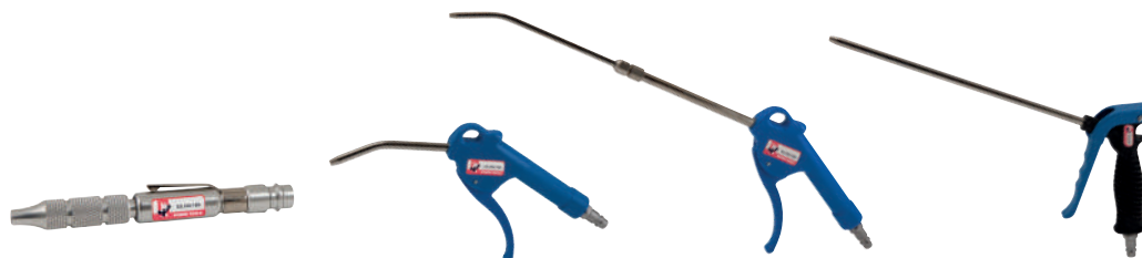
Pocket blowgun EG001B71S