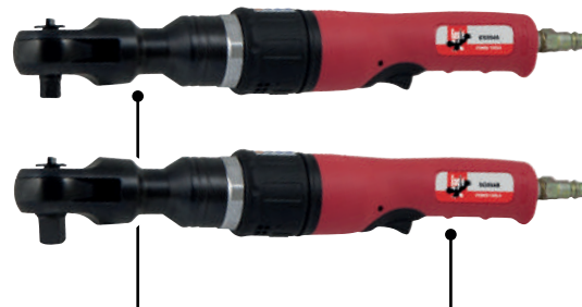
3/8" reactionless ratchet EG554A