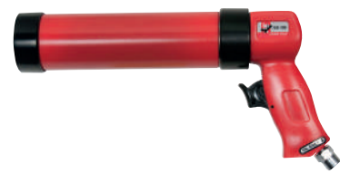
Caulking gun EG195