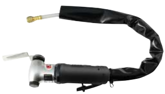
Oscillating knife kit (wind shield cutter) EG308