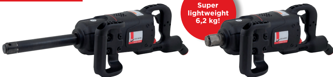
Heavy duty 1" impact wrench EG1663C