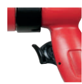
EG195 • One finger trigger to feed the material for construction and automotive repair • Capacity: 310 ml • Pressure: 2.5 ~ 5.1 bar