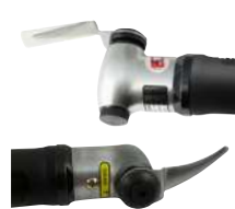
EG308 • 57 mm straight blade • 30 mm blend blade