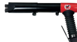
Smart Eraser EG260S-19R